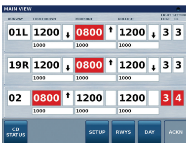
Controller Display - MainView

The displays report touchdown midpoint and rollout zone RVR, and edge and centerline runway light step settings for up to three user-selected runways. LVAT limits for each zone can be selected from a touch screen menu.